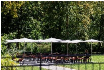
marriage ceremony on the Kobel