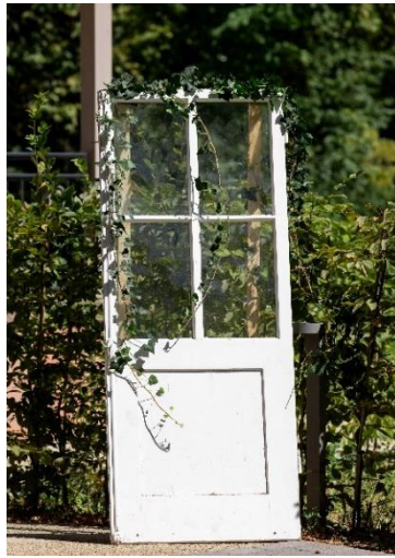
romantic wooden door for your wedding reception