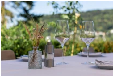
standard decoration in the Waldhaus (candles, standard table flowers)