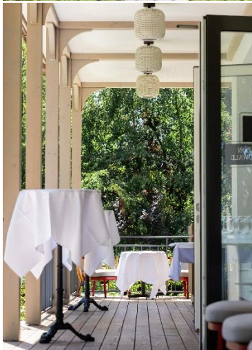
aperitif on the Veranda